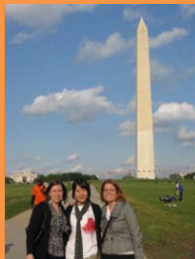
Washington DC , American University