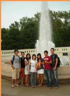
Purdue Students 2008