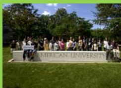
American University Students