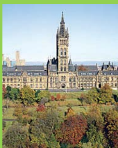
University of Glasgow