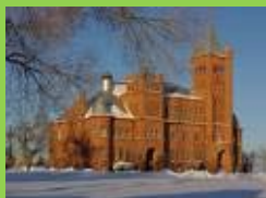
University of Westminster