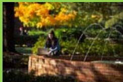
University of Richmond